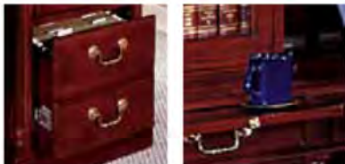
"U" Desk is shown with DMI's optional Tower CPU Stall.

Function - All drawers are suspended on fully extending, metal, ball-bearing slides allowing easy access to the entire drawer. Box drawers have a 100 lb. load bearing rating. File drawers have a 150 lb. load bearing rating and are equipped with metal rods to accommodate front-to-back letter or side-to-side legal sized hanging file folders.