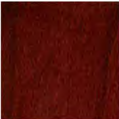
7990 (English Cherry Finish)